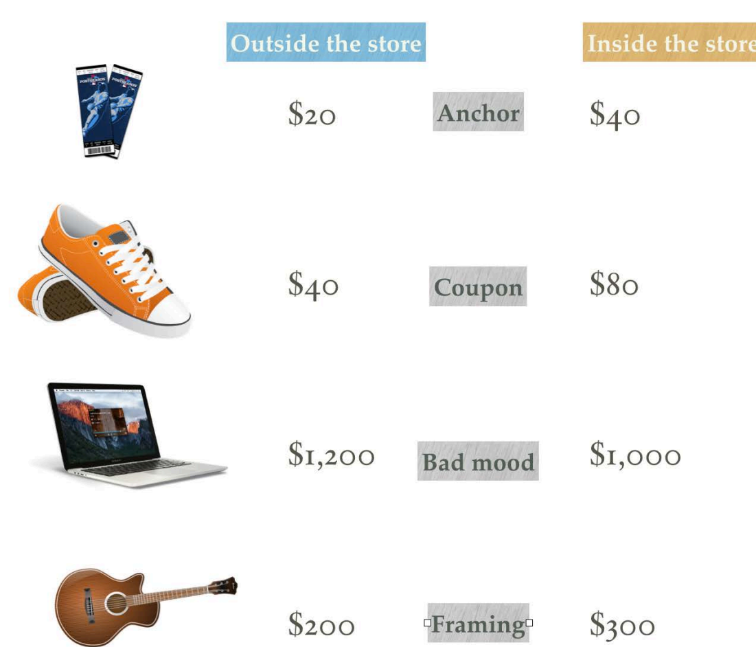
Figure 1: Changes in Willingness to Pay. Although one may have certain valuations of products prior to entering a store, that can change once inside.

This study looks at a previously unexplored factor that should in theory affect willingness to pay—budget. Moreover, it also explores whether there are differences in how people attend to stimuli when they choose to buy an item vs. when they do not in the context of budget.