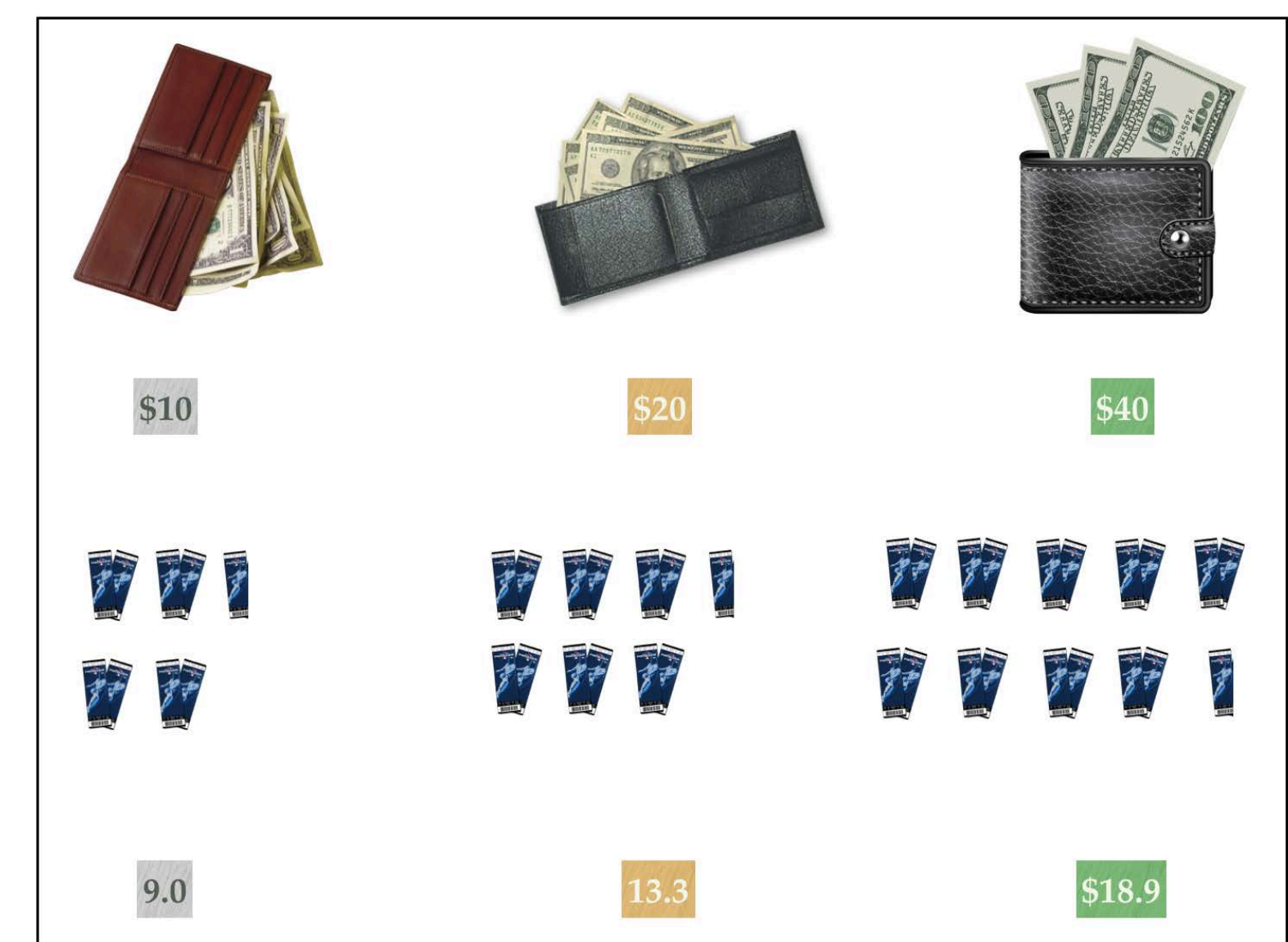
Figure 3: Average Number of Items Purchased at Different Budgets. Increased budgets resulted in more spending. (N=35)