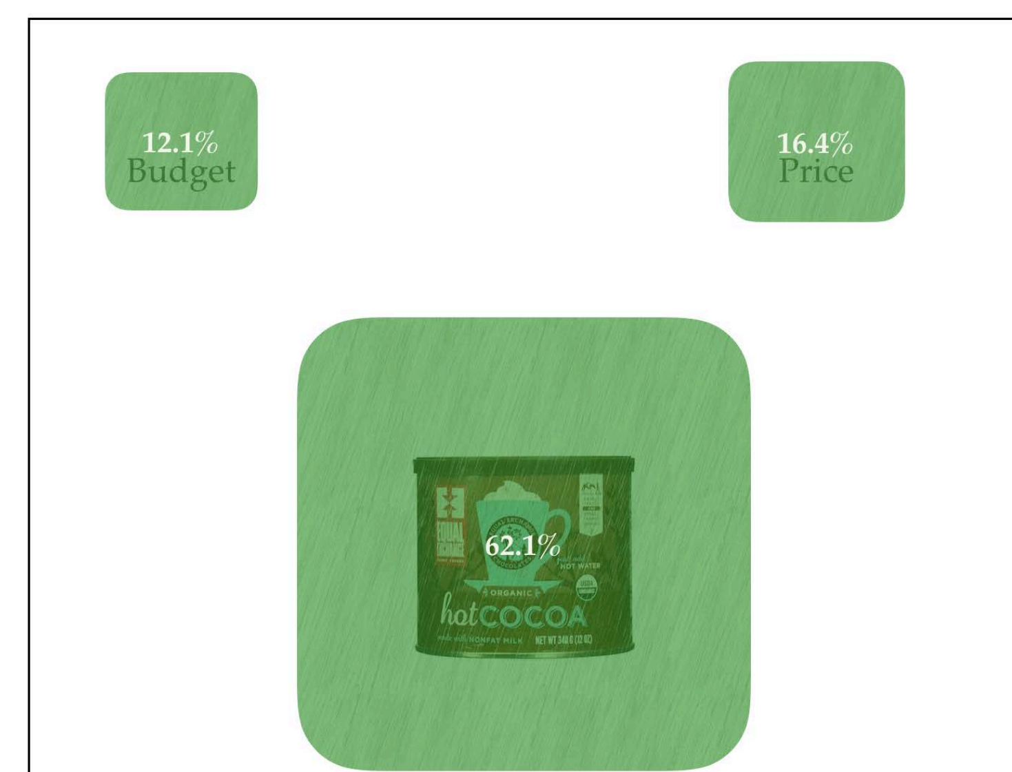
Figure 4: Breakdown of Locations of Fixations during Trials. Participants spent the majority of their time looking at the item. 9.3 percent of fixations were in neither of these three areas. (N=35)